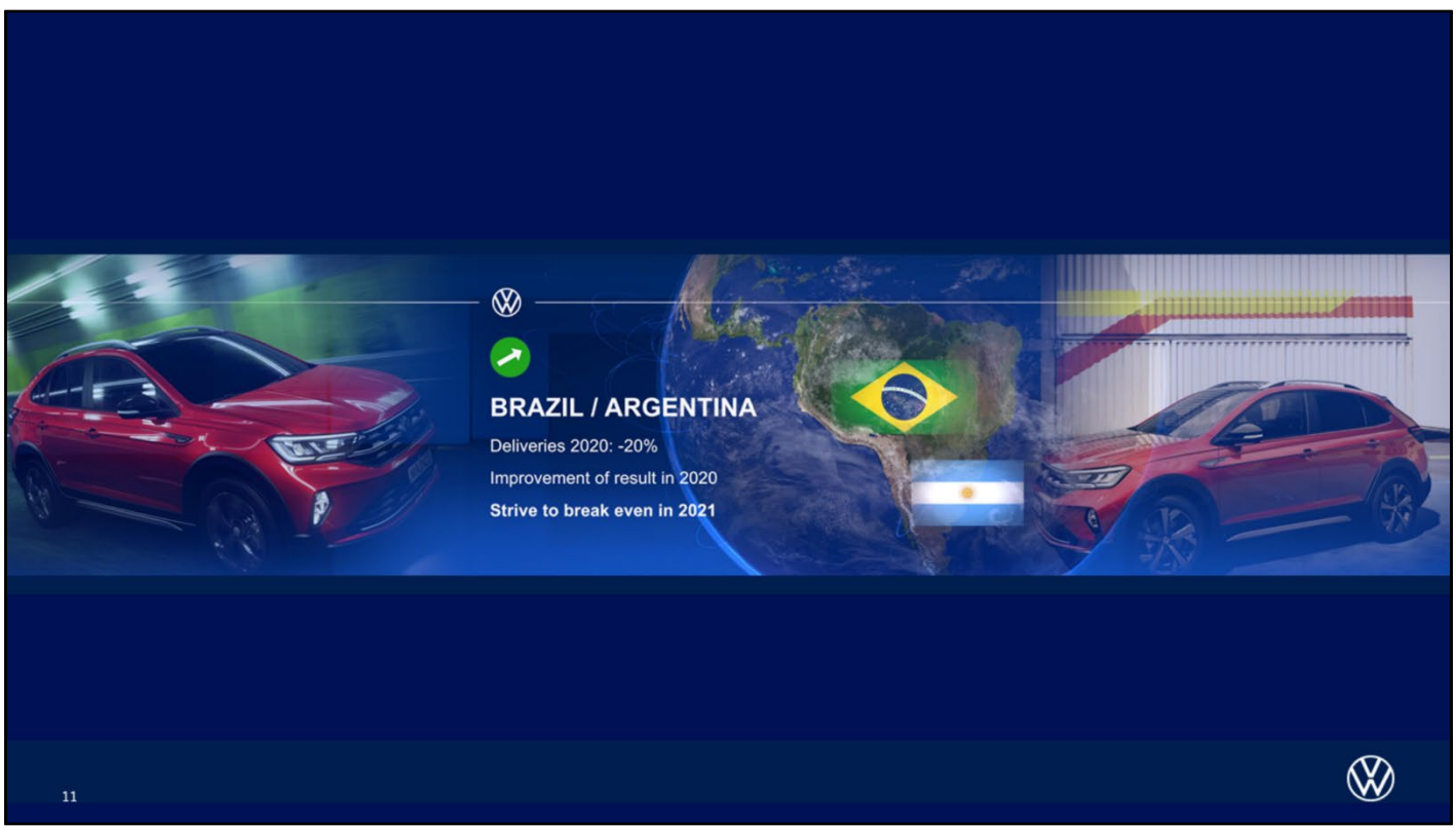
The vehicle is not sold in Germany.